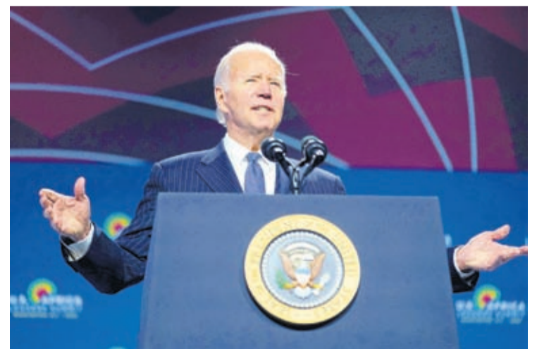
President Joe Biden speaks to African leaders gathered for the U.S.-Africa Leaders Summit Wednesday, Dec. 14, 2022, in Washington.

ities. The Biden administration is still asking Congress for billions of dollars in additional funding for the virus response. □